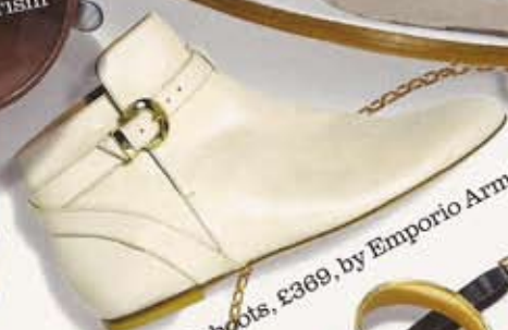
Leather boots, £389, by Emporio Armani