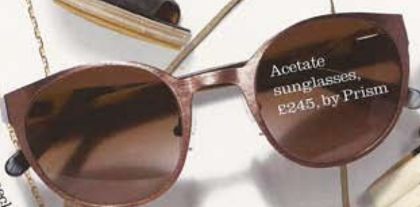
Acetate sunglasses, £245, by Prism