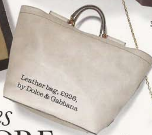
Leather bag, £926, by Dolce & Gabbana