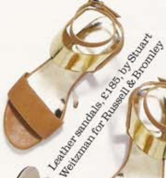
Leather sandals, £185, by Stuart Weitzman for Russell & Bromley