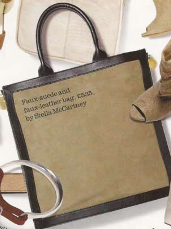
Faux-suede and faux-leather bag, £535, by Stella McCartney