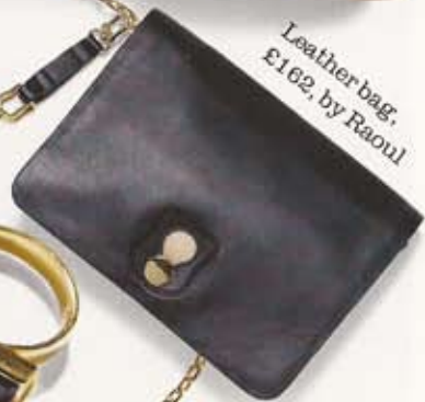
Leather bag, £162, by Raoul