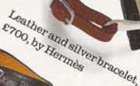
Leather and silver bracelet, £700, by Hermès