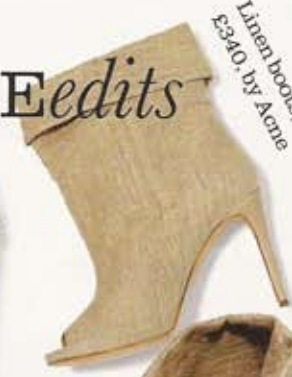
Linen boots, £340, by Acne