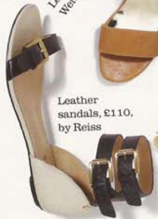
Leather sandals, £110, by Reiss