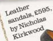
Leather sandals, £595, by Nicholas Kirkwood