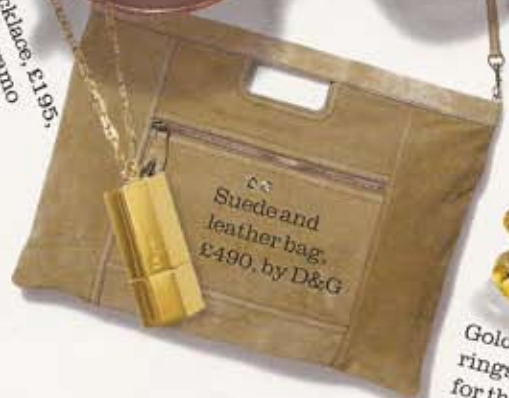
Suede and leather bag, £490, by D&G