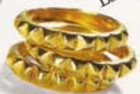
Gold-plated rings, £270 for three, by Zara Simon