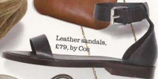
Leather sandals, £79, by Cos