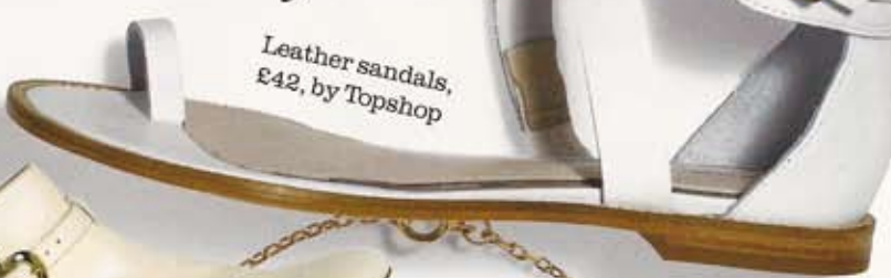
Leather sandals, £42, by Topshop