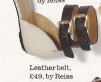
Leather belt, £49, by Reiss