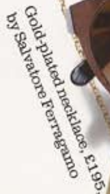
Gold-plated necklace, £195, by Salvatore Ferragamo