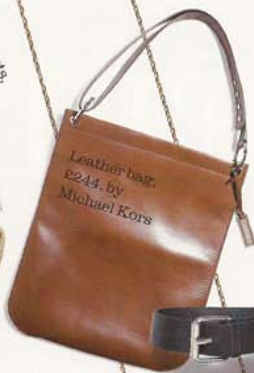
Leather bag, £244, by Michael Kors