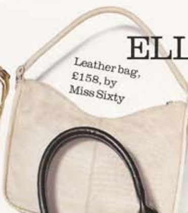
Leather bag, £158, by Miss Sixty