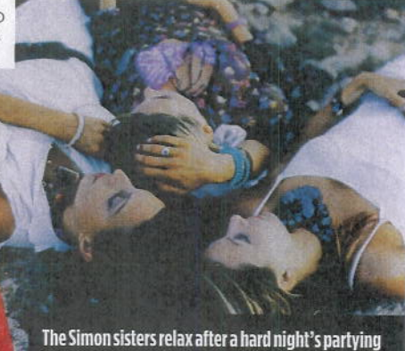
The Simon sisters relax after a hard night's partying

"The best view of the sunset is from our father's yacht 'Monsoon Jaguar', or from Benirras Beach, where there is always a party atmosphere."